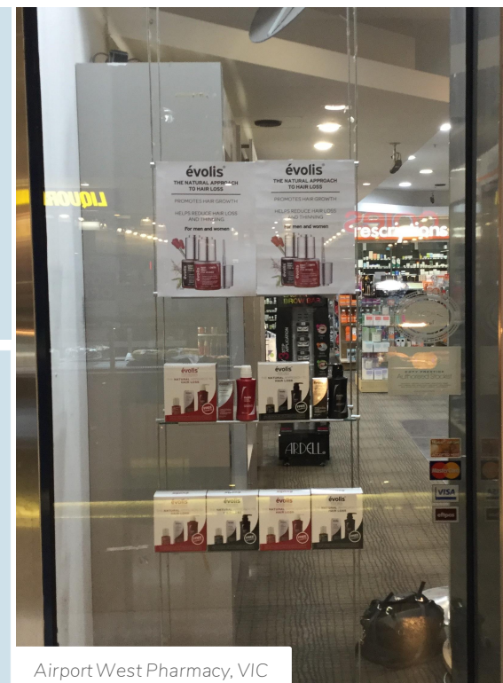
Airport West Pharmacy, VIC