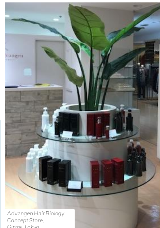
Advangen Hair Biology Concept Store, Ginza, Tokyo