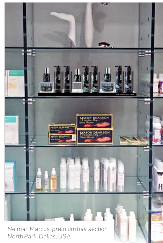
Neiman Marcus, premium hair section North Park, Dallas, USA

Continue active PR, which since March 2018 resulted in évolis® appearing in Forbes, Allure, New Beauty, Professional Beauty, aol.com, Readers' Digest, Birdie, YourTango and WWD reaching more than 219 million readers with 551 million potential impressions at the estimated ad value of US$336K.